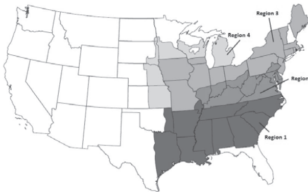
Regional Use Map

Region 1 (Maximum Rate 70 fl. oz. per Acre per Year): Includes the following states or portion of states where Forrest may be applied: Alabama, Arkansas, Georgia, Louisiana, Mississippi, Missouri (counties of Bellinger, Butler, Cape Girardeau, Dunklin, Madison, Mississippi, New Madrid, Pemiscot, Perry, Ripley, Scott, Stoddard and Wayne), North Carolina, Oklahoma (East of U.S. Highway 75 and East of Indian Nation Parkway), South Carolina, Tennessee, and Texas (includes area East of U.S. Highway 77 to State Road 239, including all of Calhoun County).